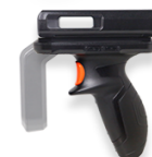
Gun Trigger (opt. UHF RFID)

* Connect up to three Dual Slot Cradle to charge up to six devices at a time