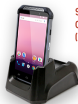
Single Slot Cradle (opt. Ethernet)